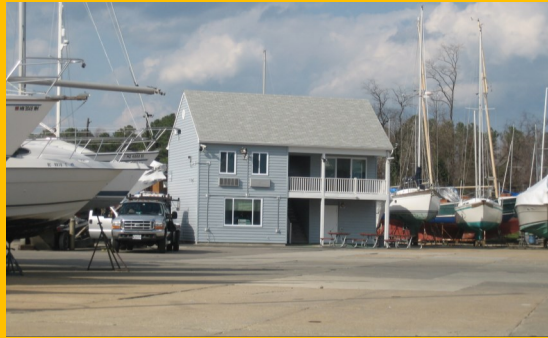
Visit the Carr Creek Marina at 338 Halligan Rd. on the grounds of the Naval Support Activity Annapolis.

The course is offered one Saturday per month during the winter from 8a.m. to 5p.m. with an hour for lunch. This course is taught in the classroom and outside, so dress accordingly. Class reservations are now being taken for the entire winter. Advanced registration is required as there is a minimum class size. Please contact the Marina for cost and more details.