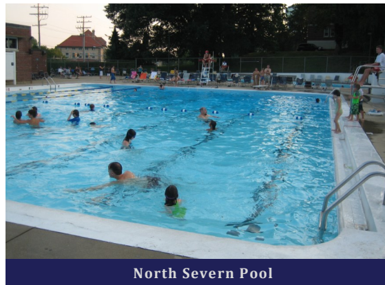
North Severn Pool

There are two outdoor swimming pools. South Severn Pool, across from USNA Gate 8, is open during summer months Memorial Day weekend through Labor Day. Swim lessons are available in two 8-day sessions. The North Severn Pool, located behind the Youth Center, is open late June to late August, Mon.—Fri. Family and single season passes are available at the BJCC Bldg. 46 and keep costs low for frequent swimmers. Daily fees are available. Lap (fitness) swimming is available only at the South Severn