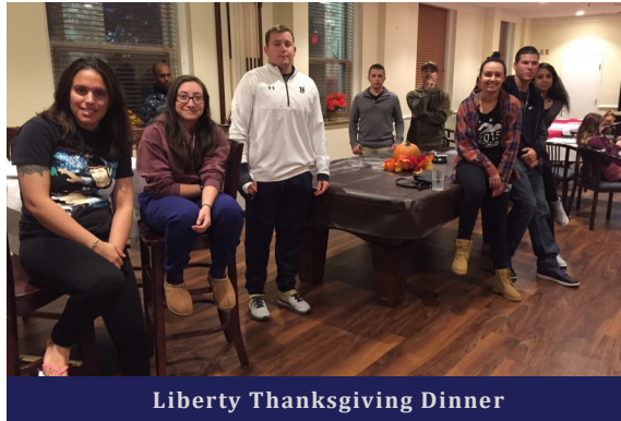
Liberty Thanksgiving Dinner

The Recreation Building, located at 89 Bennion Road at Naval Support Activity Annapolis, houses the MWR Auditorium and the Fitness center, a full-court gymnasium, weight and cardio equipment, day lockers and showers, functional fitness room, spin room and