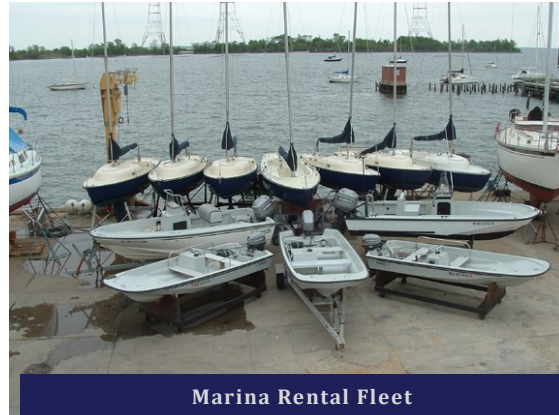
Marina Rental Fleet

Pool. Pools also available for party rentals. For information, call 410-293-9204