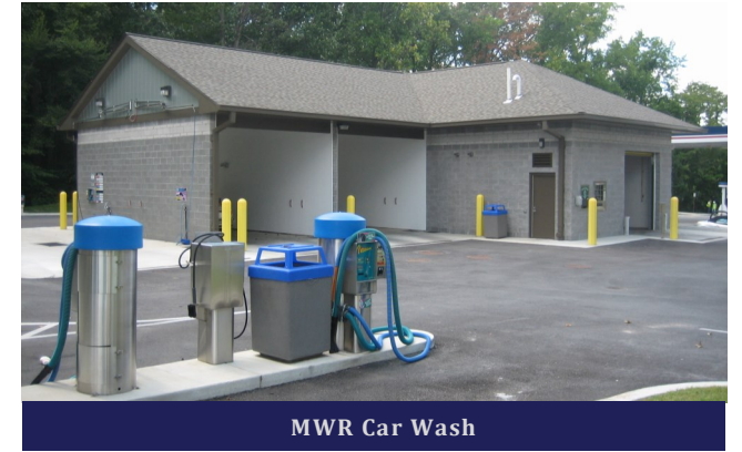
MWR Car Wash

The Auto Skills Shop is a fully equipped, self-service repair facility located across from the MWR Carr Creek Marina. The shop offers eight bays (four with hydraulic lifts), motorcycle lift, battery charger, electric drills, engine stands, puller set, tire balancer, tire mounter, storage, used oil / anti-freeze repository during open hours, and professional guidance. Check your vehicle with the computer for information on