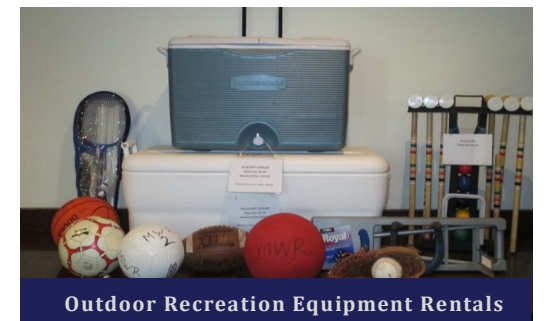
Outdoor Recreation Equipment Rentals